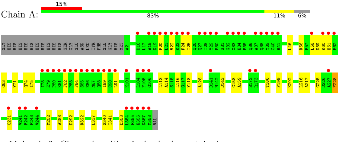
• Molecule 2: Charged multivesicular body protein 4c

• Molecule 1: Programmed cell death 6-interacting protein